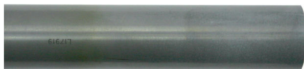
Ceramic outer tube

A combination of high temperature and salt deposit causes a quartz torch to devitrify. Higher concentrations of salt in the samples lead to more rapid devitrification. The quartz torch in the photo was run for only 6 hours with samples containing 10% NaCl and is already badly degraded. By contrast, the ceramic material does not devitrify and is not affected by salt deposits.